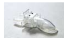
V923 YG-122T for oxygen cannula adjustment