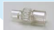
R804 YG-111T (4 cc dead space)